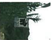
On and Off Leash Area signage