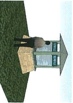
Off Leash Area Kiosk