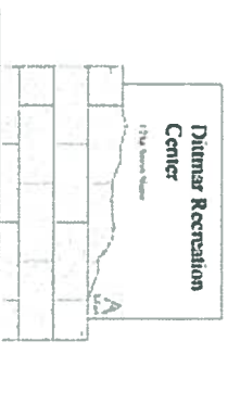
New Park Sign at Primary Entrance