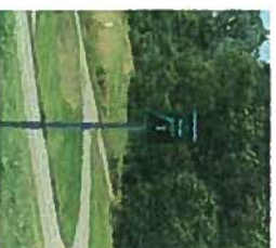
Next Mile Dispenser