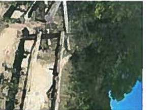
Walk in Neighborhood Entrance